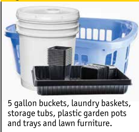
5 gallon buckets, laundry baskets, storage tubs, plastic garden pots and trays and lawn furniture.