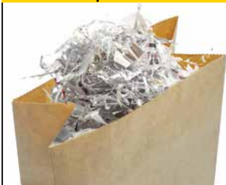
Contained in a brown paper bag.