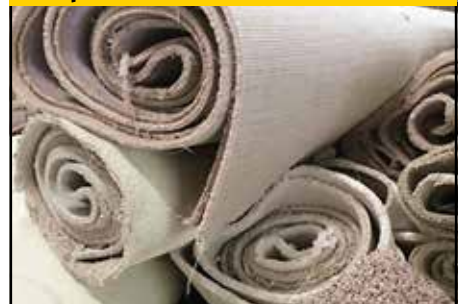
Must be separate from padding, clear of tack strips, nails, and other debris.