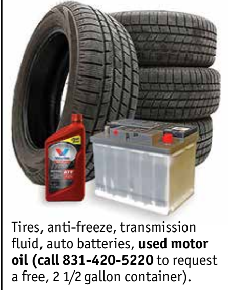
Tires, anti-freeze, transmission fluid, auto batteries, used motor oil (call 831-420-5220 to request a free, 2 1/2 gallon container).