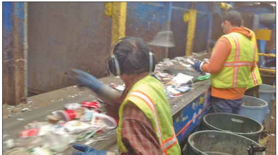
Stopping the sorting line for bagged materials or needles costs time and money.