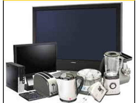
Computers and monitor, Televisions and stereos, small electronics and appliances.