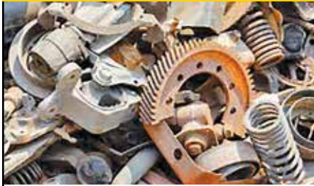
Large appliances, furniture, motors, engines and transmissions (must be drained of all fluids).