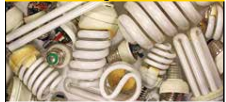
Limit 10 per visit.