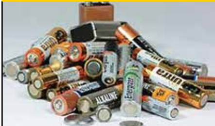
(AAA, AA, C, D, 9-volt, button cell and lithium ion).